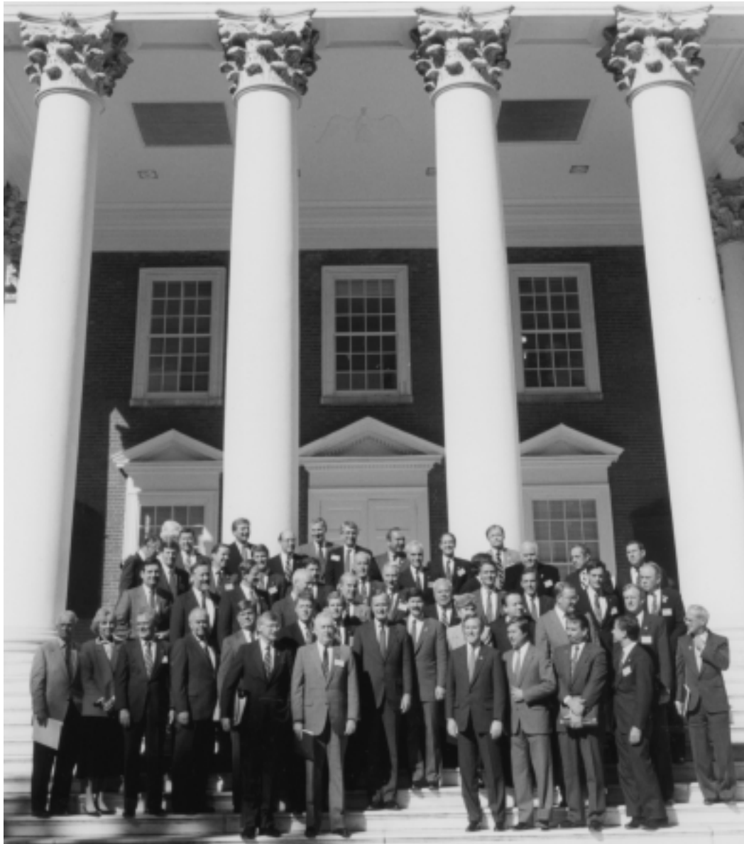
President Bush and the nation's Governors on the steps of the University of Virginia at Charlottesville, September 28, 1989.

The joint communiqué then listed the four areas of agreement reached at the summit: