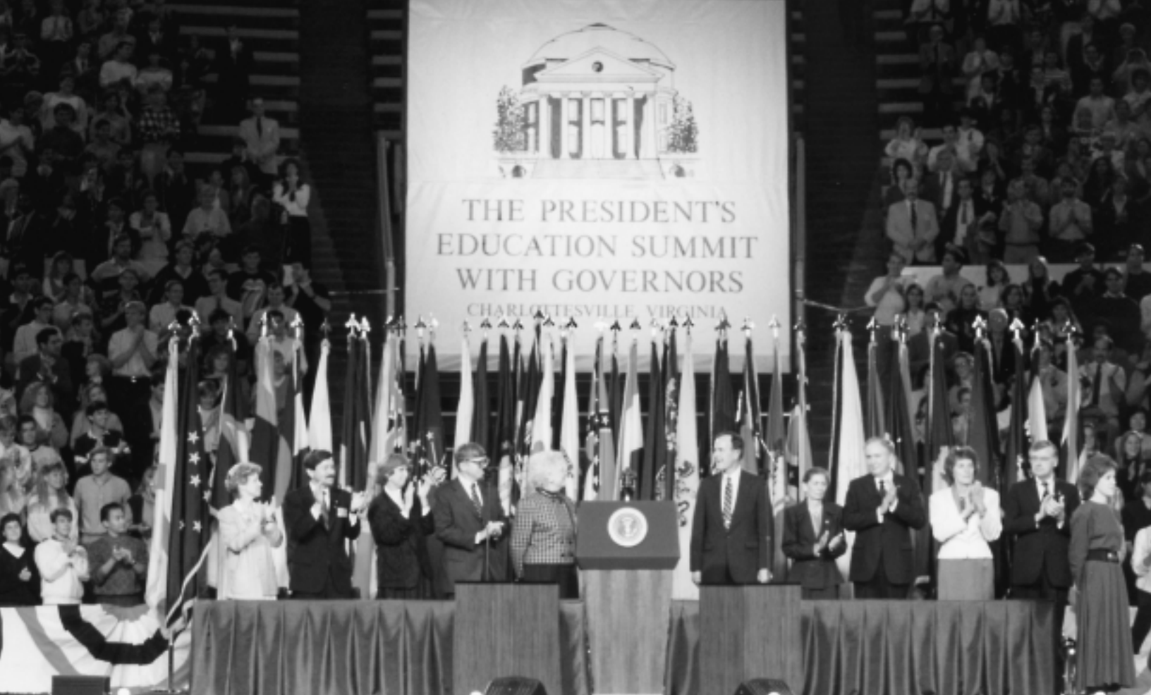
President and Mrs. Bush with the Governors and their wives at the 1989 Education Summit at Charlottesville.