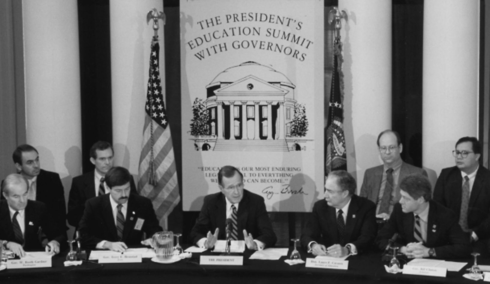
President George Bush and U.S. Secretary of Education Lauro Cavazos (right of Bush) with Governors (left to right) Booth Gardner (D-WA), Terry Branstad (R-IA), and Bill Clinton (D-AR).

This essay will provide a brief analysis of educational changes in the late 1970s and early 1980s and then analyze the highly controversial report A Nation at Risk , which argued that American education was declining and threatening the economic well-being of the nation. After considering the reactions of the Bush administration, the National Governors' Association (NGA), and other policymakers to the mid-1980s educational crisis, the study will discuss the origins and deliberations at the Charlottesville Education Summit. While this particular analysis can provide only a brief discussion of the complex road to the Charlottesville Education Summit, hopefully it will stimulate additional investigations and in the next chapter provide a broader, historical framework for analyzing the creation of the six national education goals. 4