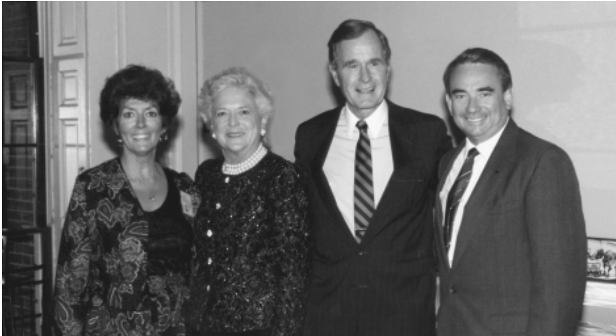
President and Mrs. Bush with Governor and Mrs. Tommy Thompson. Governor Thompson (R-WI) is a current NEGP member.

education goals. 79 When Dukakis presented his views on education in Phi Delta Kappan , he stressed three issues: