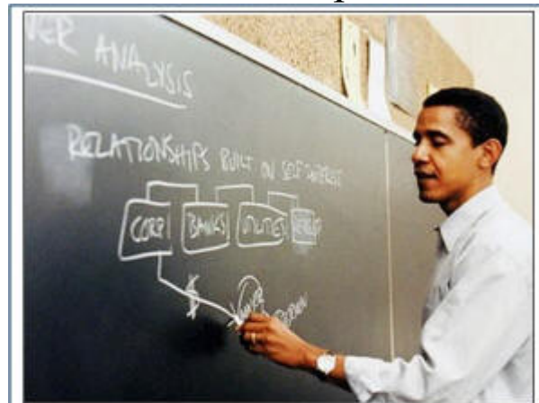
Obama teaching at the University of Chicago Law School. The topic is apparently "Power Analysis," also his topic at ACORN training. The illustration is labeled "Relationships Built on Self Interest." Follow the money trail: Barack Obama teaching students in Chicago the Alinsky Principles—specifically, Alinsky's power analysis, which looks at relationships built on self-interest between corporations, banks, and utilities. Notice the flow chart indicating the flow of money and power out of the private sector ("CORP") and into the public sector ("MAYOR").

"Building relations on self interest," i.e., on lust , i.e., on what you covet is the hallmark of Marxism, socialism, globalism, turning you into "human resource" to be used by the Marxist, socialist, globalist for his own pleasure, casting you aside when you no longer serve his 'purpose,' i.e., satisfy his lusts or get in his way—doing to you what you did to the father/Father for getting in your way. God, i.e., God's Word warns you of what will happen when you turn from the father's/Father's